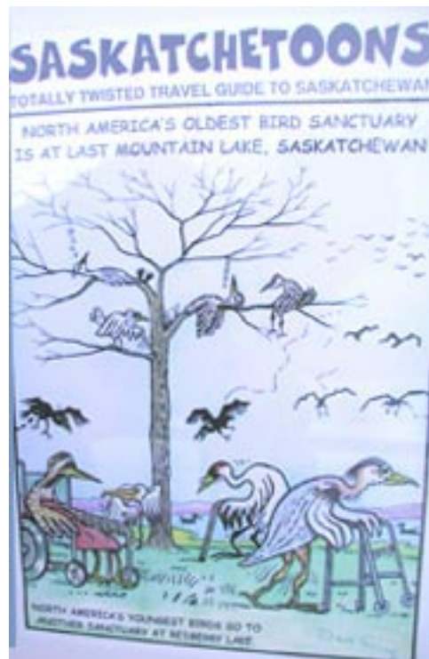
North America's Oldest Bird Sanctuary Is At Last Mountain Lake, Saskatchewan North America's Youngest Birds Go To Another Sanctuary at Redberry Lake.

On behalf of the Prince Albert Sailing Club, I would like to take this opportunity to wish everyone a safe and happy holiday season. ■